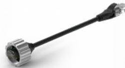
Cable PoE – 5m