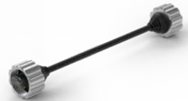
Cable PoE Injector – 5m