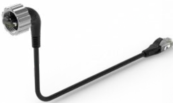
Cable 90° PoE – 5m