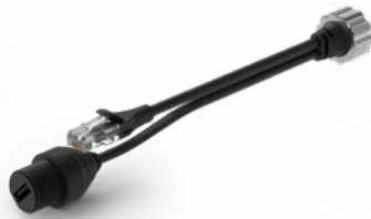
Cable PoE-USB – 5m